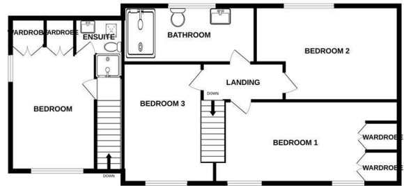
1ST FLOOR 993 sq.ft. (92.3 sq.m.) approx.